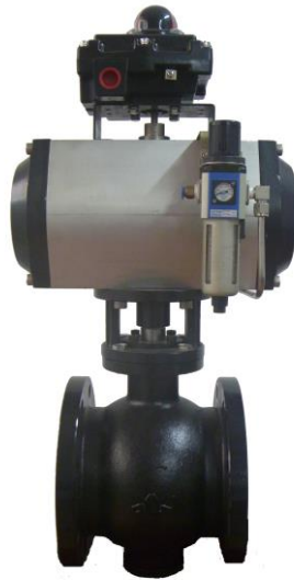
Fig. 1 Pneumatic double eccentric half ball valve

requirements of the control system; The double acting valve will remain in place.